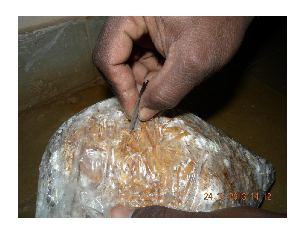
Fig 2. Making a slit or hole (12-14 holes)