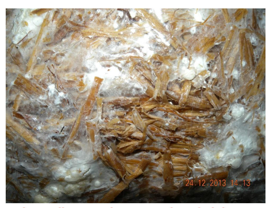
Fig1: Fully grown bag or Ready to fruit bag