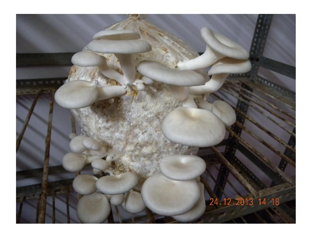
Fig 5. Mushroom ready for harvest