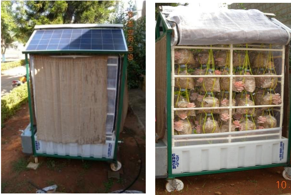
Fig. Solar Power Integrated Outdoor Mushroom Growing Unit

The present technology relates to the production of oyster mushroom by using low cost Solar Power Integrated Outdoor Mushroom Growing Unit which can be at both rural and urban levels. Presently most of the growers are using permanent or semi permanent structures for growing these mushrooms. The newly designed outside mobile chamber is low cost in comparison to the permanent building and even during non favourable conditions like months of April and May, the mobile chamber gives a better environment for mushroom growing due to its evaporative cooling principal as compared to permanent structures. As the availability of the space and capacity of the investment is less, maintenance is easy and less costly for adoption. Such structures will help in developing entrepreneurship not only in mushroom cultivation but also to fabricate and sell the units to the needy growers. It enhances mushroom cultivation to make mushroom as a part of diet. Daily consumption which can help in mitigation of malnutrition and also additional income can be generated for entrepreneurship development especially among women.