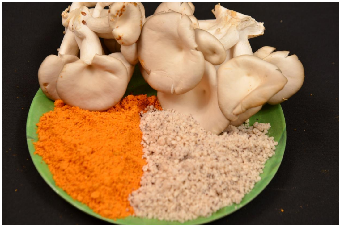
iv. Mushroom Coconut chutney powder