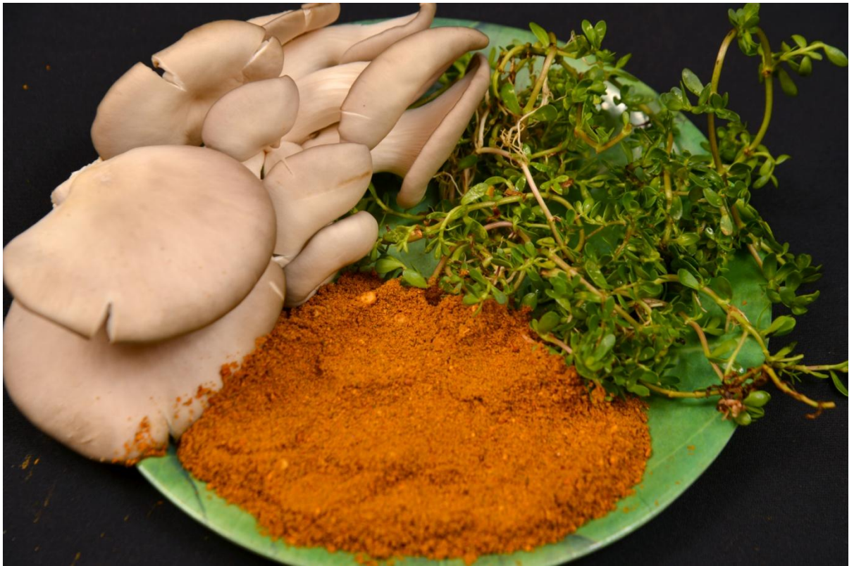
vii. Mushroom Flax seed chutney powder