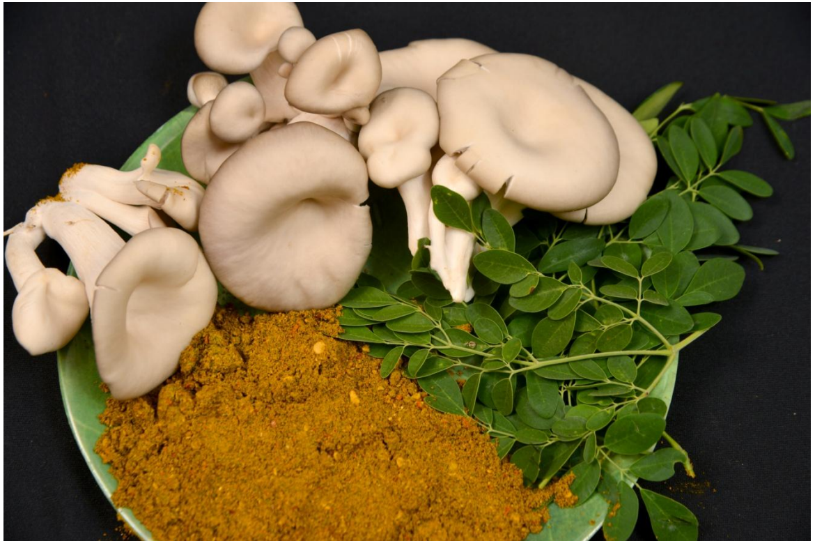
iii. Mushroom Moringa leaf chutney powder