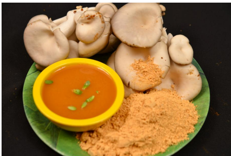
Mushroom Fortified Instant Rasam Mix