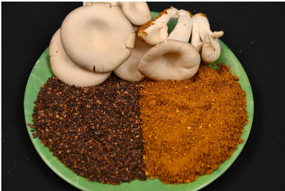
ii. Mushroom Black sesame chutney powder