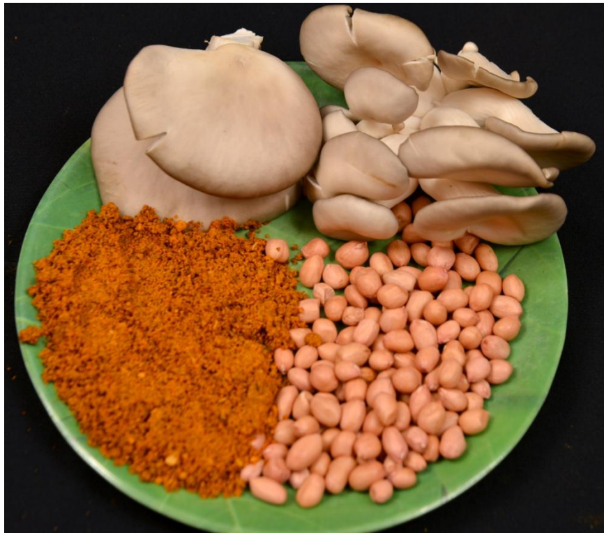
v. Mushroom Groundnut chutney powder