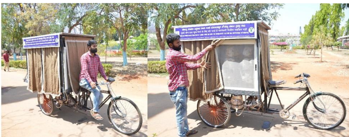
SOLAR POWER OPERATED TRYCYCLE CART FOR VENDING READY TO HARVEST FRESH MUSHROOM