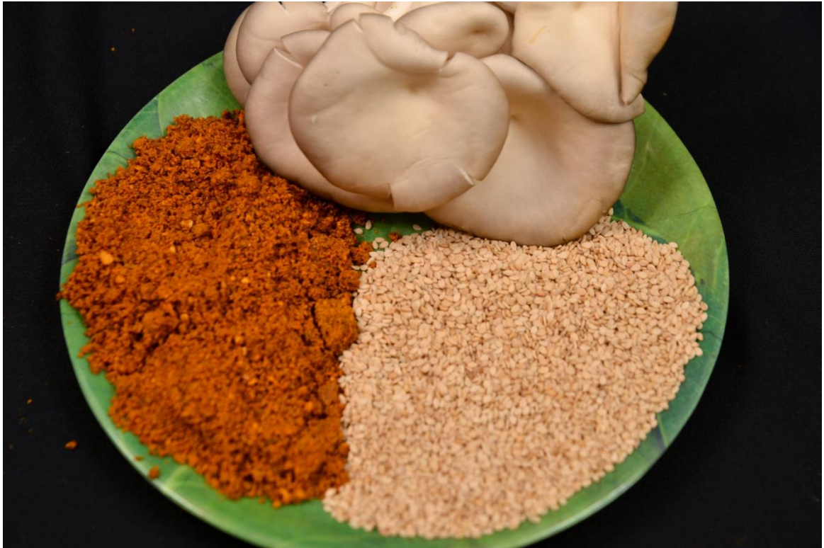
i. Mushroom white sesame chutney powder