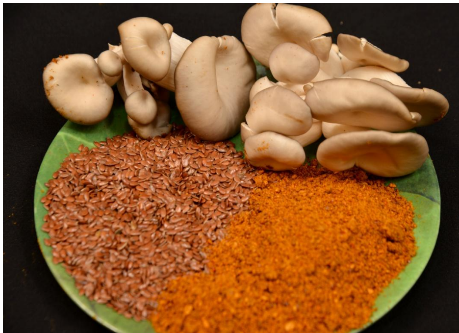
vi. Mushroom Flax seed chutney powder